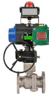
Automated Ball Valve with MOR