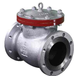
Swing Check Valves