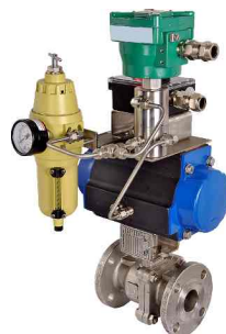
On - off Standard Ball Valve