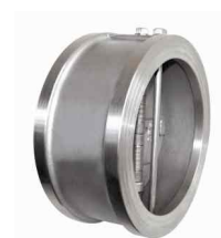
Dual Plate Check Valves