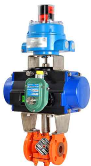
Automated Plug Valve