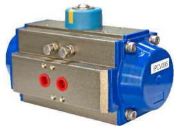
Quarter Turn Pneumatic Actuator