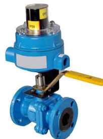
Manual Ball Valve with Limit Switch Box

Full range of solutions meeting all your needs