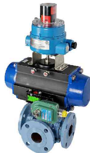
Automated Multi Port Ball Valve