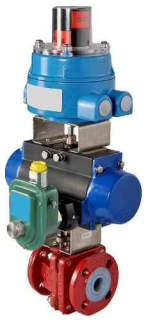
Automated Lined Ball Valve