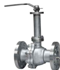
Valve with Extended Stem