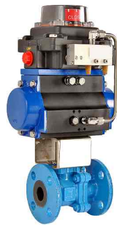
Ball Valve Automation Topworx ValveTop